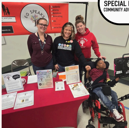
Pictured here: EG SPEAKS at the CAC Resource Fair