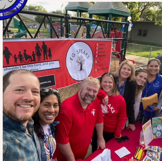
Pictured here: EG S.P.E.A.K.S. board members, EGUSD School board members, EGUSD staff and SELPA/SpEd director