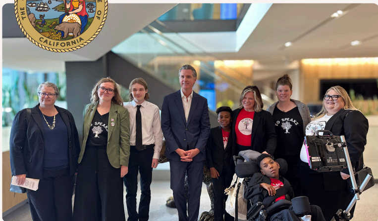
Pictured here: Members of the EG SPEAKS board and volunteers, Governor Gavin Newsom, and students.

Thank you, Assemblymember Stephanie Nguyen for inviting EG SPEAKS as a guest for HR 24, Development Disability Awareness Month. We appreciate the time that Governor Newsom took to meet us and the EGUSD families and faculty who attended.